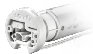
White (supplied with motor) #9027132