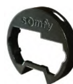
Optional Black #9027134