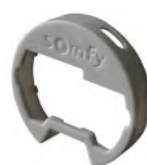
Optional Grey #9027133